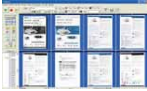
The AvScan 5.0 main screen

-The Intelligent Document Management Tool